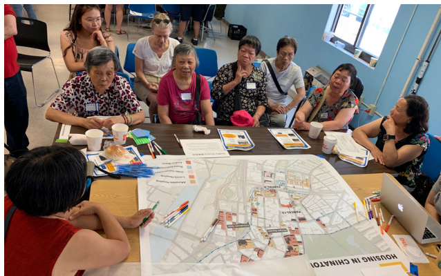
A local community design charrette hosted by the Asian Community Development Corporation to discuss future changes to Chinatown.

We also bring strong relationships with the BPDA, the Department of Neighborhood Development, Boston Water and Sewer, Boston Parks, Boston Inspectional Services, Boston Fire, Boston Police, The Assessor's Office, Boston Neighborhood Services, City Council Members and community leaders to the project.